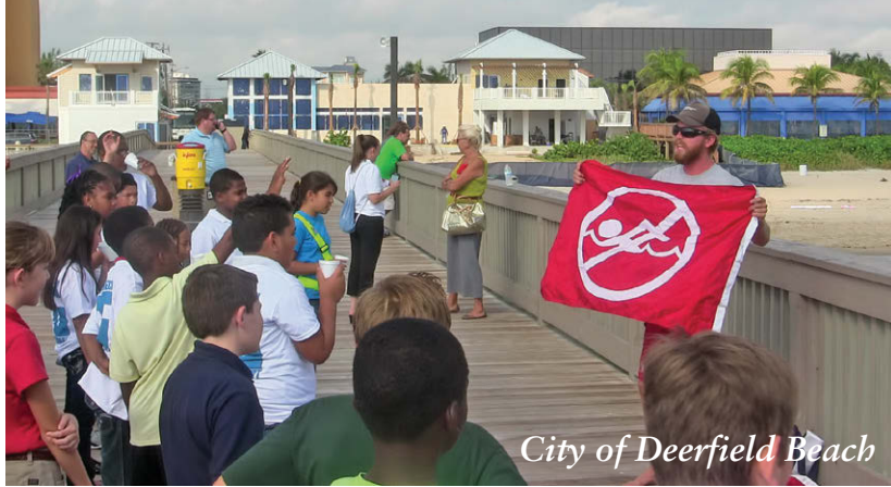
City of Deerfield Beach

Government Days on two separate days, inviting fourth- through 12th-graders from local elementary, middle and high schools. Students were greeted at City Hall by Mayor Peggy Noland before boarding two tour buses for a guided tour of the city. The students enjoyed a visit to the International Fishing Pier, where they observed presentations about current pier renovations and ocean rescue operations. They also were taken to the city’s Westside Park, where they observed a live K-9 demonstration and learned what it takes to be a police officer and firefighter/EMT. Students were then able to enjoy lunch while learning about the city’s “All In” recycling program. Finally, they visited the water plant and learned about the water filtration process and how raw water is transformed into clean drinking water.