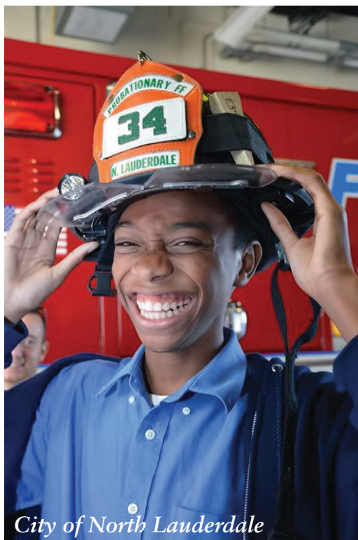
City of North Lauderdale

Oakland owns and operates the Oakland Avenue Charter School, a K-5 facility with about 525 students. Each year, the town hosts a shadowing day, during which the students have opportunities to shadow the town manager and town engineer. Town staff also participate in judging the fifth-grade students' science projects.