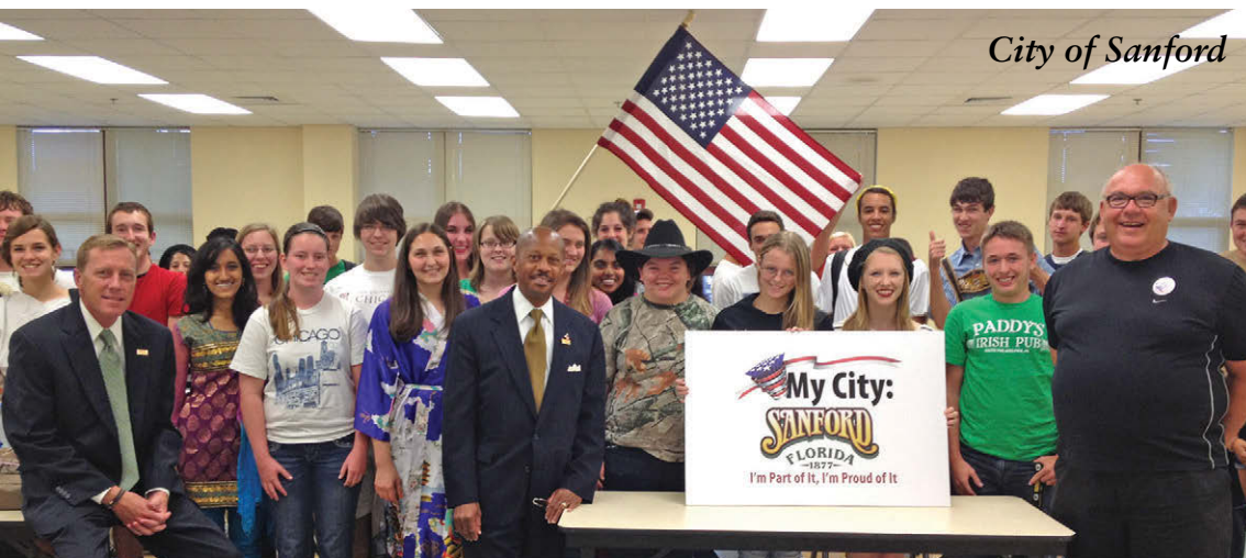
City of Sanford

Sopchoppy to how students could be involved in their city government.