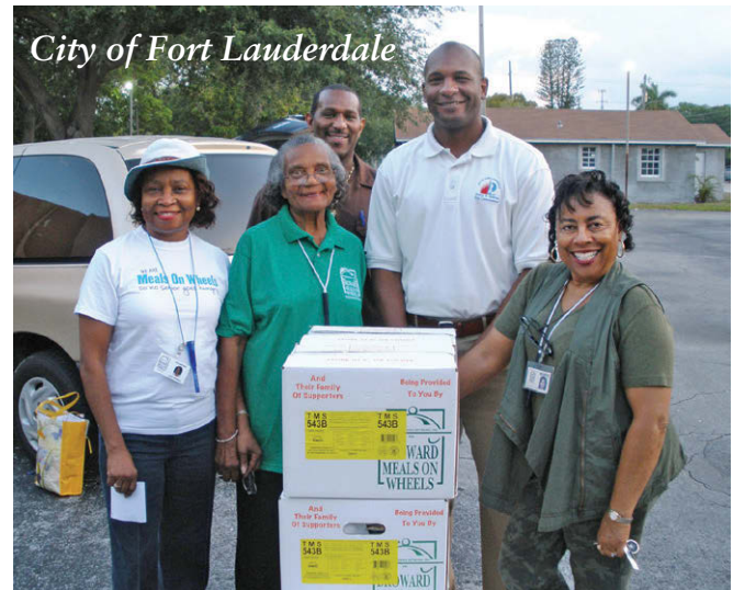
City of Fort Lauderdale

council members and staff in Okaloosa County had an opportunity to job-shadow someone from a fellow city in a similar job, with the goal of learning how to improve governmental processes. The program was a success, with 22 people from 12 municipalities participating. A proclamation was also made by the City of Destin to recognize Municipal Job Shadow Week. The city coordinated with local media, which covered both the open house and Municipal Job Shadow Week.