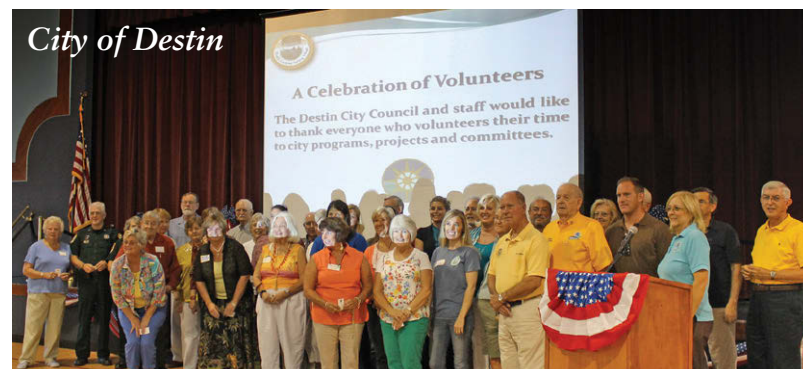
City of Destin

This year during Florida City Government Week, students from the three Fort Lauderdale high schools experienced firsthand what it’s like to be a participating member of the city.