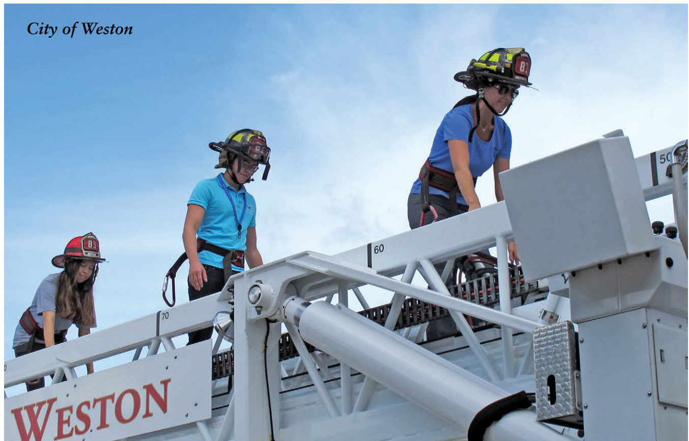
City of Weston

Weston adopted a proclamation recognizing Florida City Government Week and provided the League's "My