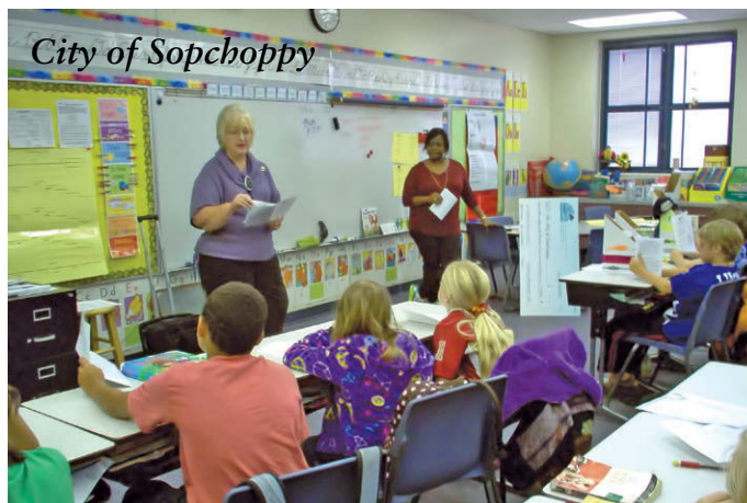
City of Sopchoppy

Sopchoppy participated in Florida City Government Week by visiting Medart Elementary School and speaking to the fourth-grade classes about municipal governments. Using information gained from the Florida League of Cities website and from local sources, a booklet was created for the students that included everything from the history of