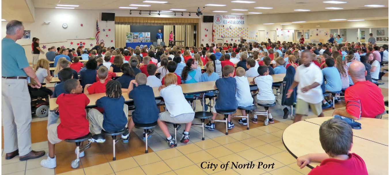
City of North Port