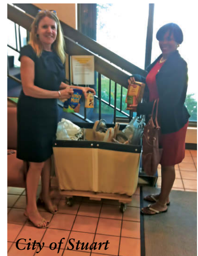
City of Stuart

In celebration of Florida City Government Week, Stuart adopted a proclamation. The city also partnered with the House of Hope of Martin County, a not-for-profit community service agency, and founded a food drive at City Hall and the Public Safety Complex. With the message printed on customers’ utility bills and on the city’s website,