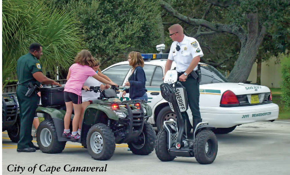
City of Cape Canaveral